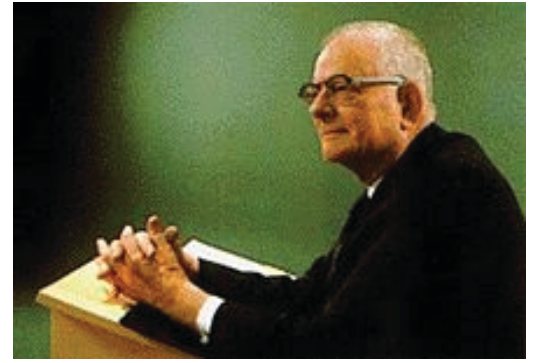
Dr. W. E. Deming (1900 - 1993)

The winners of the Deming Prize have amounted to 252 organisations in total, including 55 from overseas, till 2018