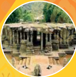
1000 pillar temple