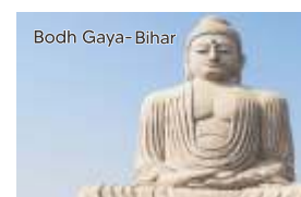
Bodhi Gaya- Bihar