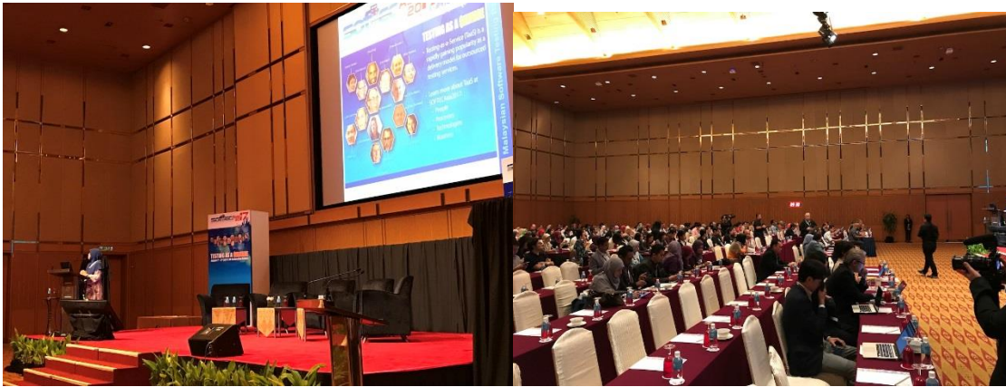
[SOFTEC main room]