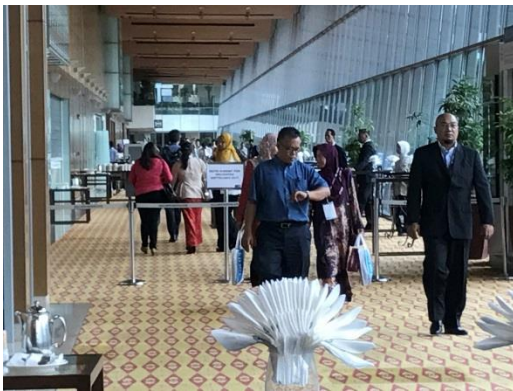
[Participants gathering at the ASQN conference venue]